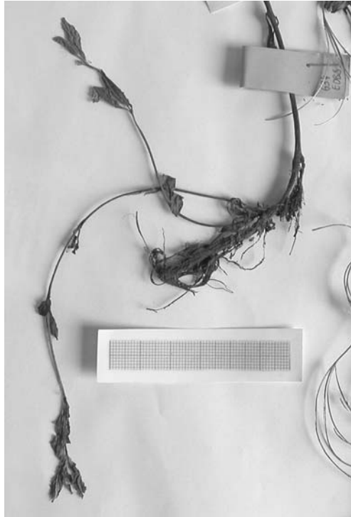
Figure 1: Stem base with two long, leafy stolons of Epilobium obscurum .

Slika 1: Dno stebila z dvema dolgima, zelenima, olistanima pritlikama pri vrsti Epilobium obscurum .