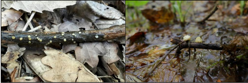
Figure 2. Two new fungi species for Slovenia, photographed at the sites within Tivoli, Rožnik and Šišenski hrib Landscape Park in 2019. Left: Vibrissea filisporia on a fallen branch at Mostec; right: Cudoniella tenuispora on a hardwood fallen branch at Mali Rožnik.

Slika 2. Dve vrsti gliv, novi za Slovenijo, fotografirani na rastišču v Krajinskem parku Tivoli, Rožnik in Šišenski hrib v letu 2019. Levo: Vibrissea filisporia na padli veji v Mostecu; desno: Cudoniella tenuispora na padli veji v Malem Rožniku.