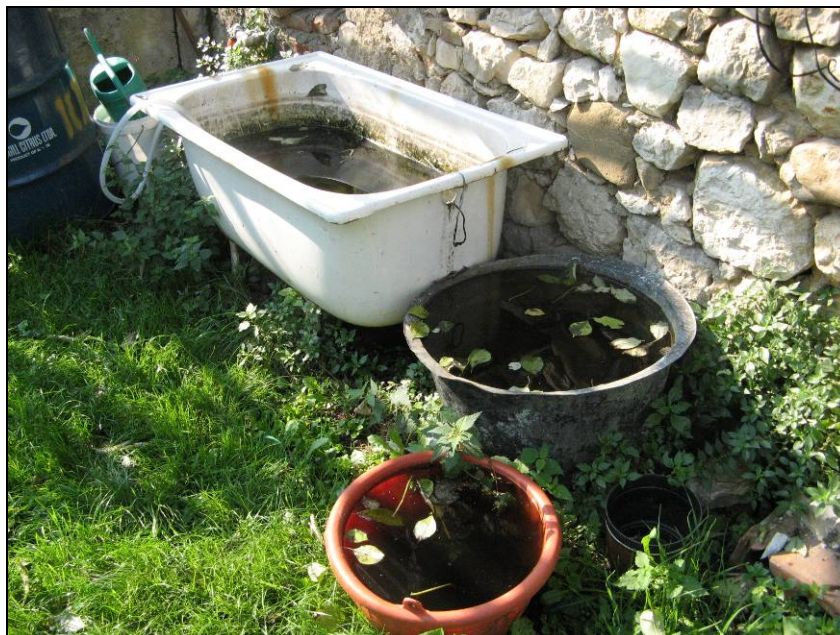
Figure 1. A typical habitat of Ae. albopictus larvae (Foto: Katja Kalan) Slika 1. Habitat, značilen za ličinke Ae. albopictus (Foto: Katja Kalan)

All of 102 adults that were caught near the breeding sites in 2007 were Ae. albopictus . The highest number of the adults, caught in 15 minutes, was in Portorož (27 individuals) and in Ankaran (8 individuals). The number of the adults at other locations varied from one to three, but most often one mosquito was caught (Tab. 1). No adult mosquitoes were caught in 2010.